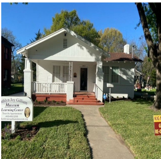
Restored KJGM Museum