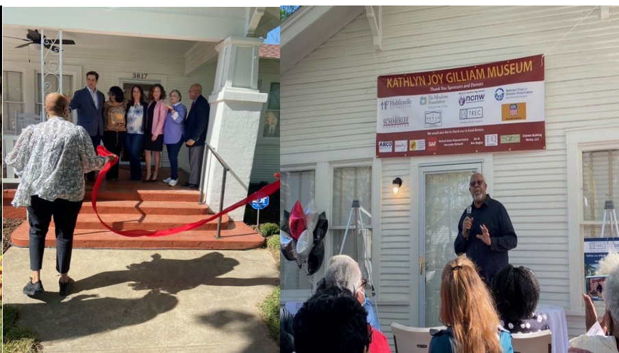
Ribbon Cutting with TREC