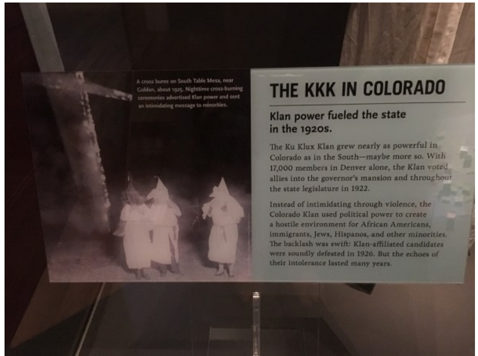
The current text panel