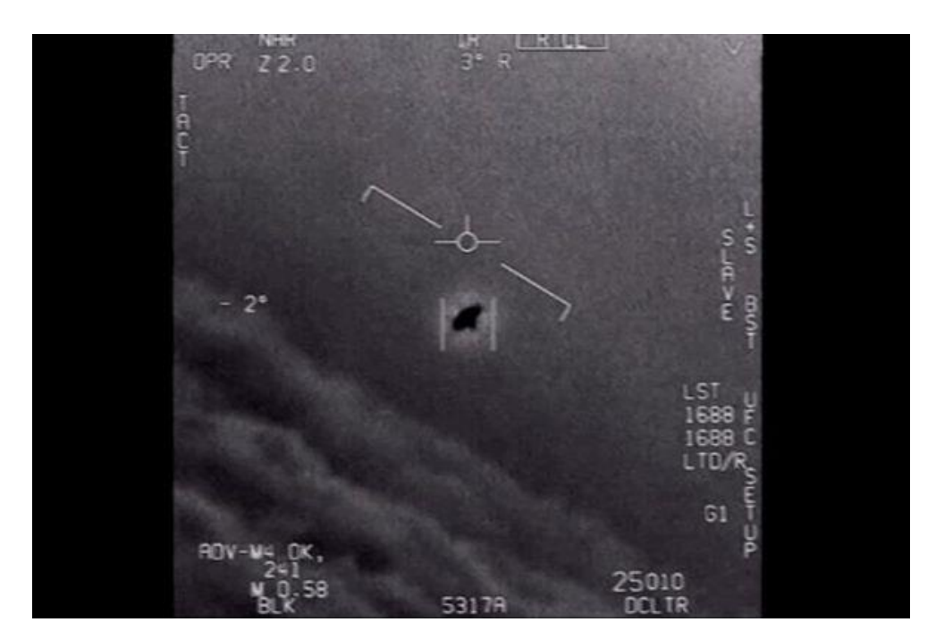
Single frame from US Navy video (Illing, 2020)

During the twenty-first century, climate change is expected to bring more fluctuations in air pollution. These changes could greatly increase annual premature deaths worldwide. Scientists urge stronger emission controls to avoid worsening air pollution and the accompanying deterioration of health and wellness.