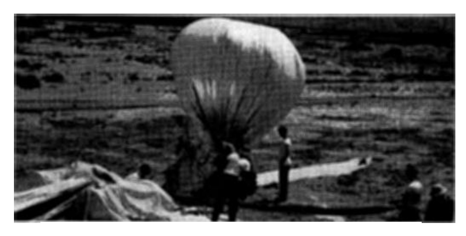
A US Air Force photo of Holloman Balloon Branch personnel preparing a polyethylene balloon laminated with aluminum at the White Sands Proving Ground, New Mexico (McAndrew, 1997).

Shards of metalized polyethylene covered the debris field. Other materials reportedly salvaged from the debris field that were typically incorporated into the 1947 experimental balloon trains included, but were not limited to: pieces of rubber, parts of reflective panels made of balsawood and reflective paper, purplish-pink reinforcement tape imprinted with symbols, and heavy-gauge nylon rope.