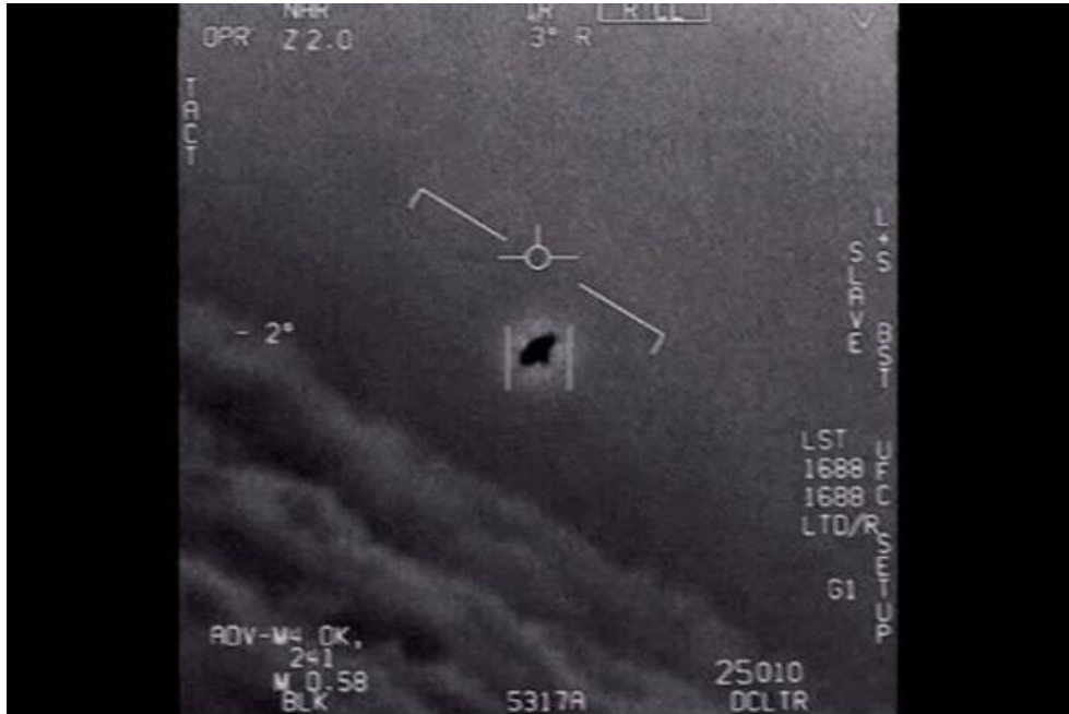
Single frame from US Navy video (Illing, 2020)

During the twenty-first century, climate change is expected to bring more fluctuations in air pollution. These changes could greatly increase annual premature deaths worldwide. Scientists urge stronger emission controls to avoid worsening air pollution and the accompanying deterioration of health and wellness.