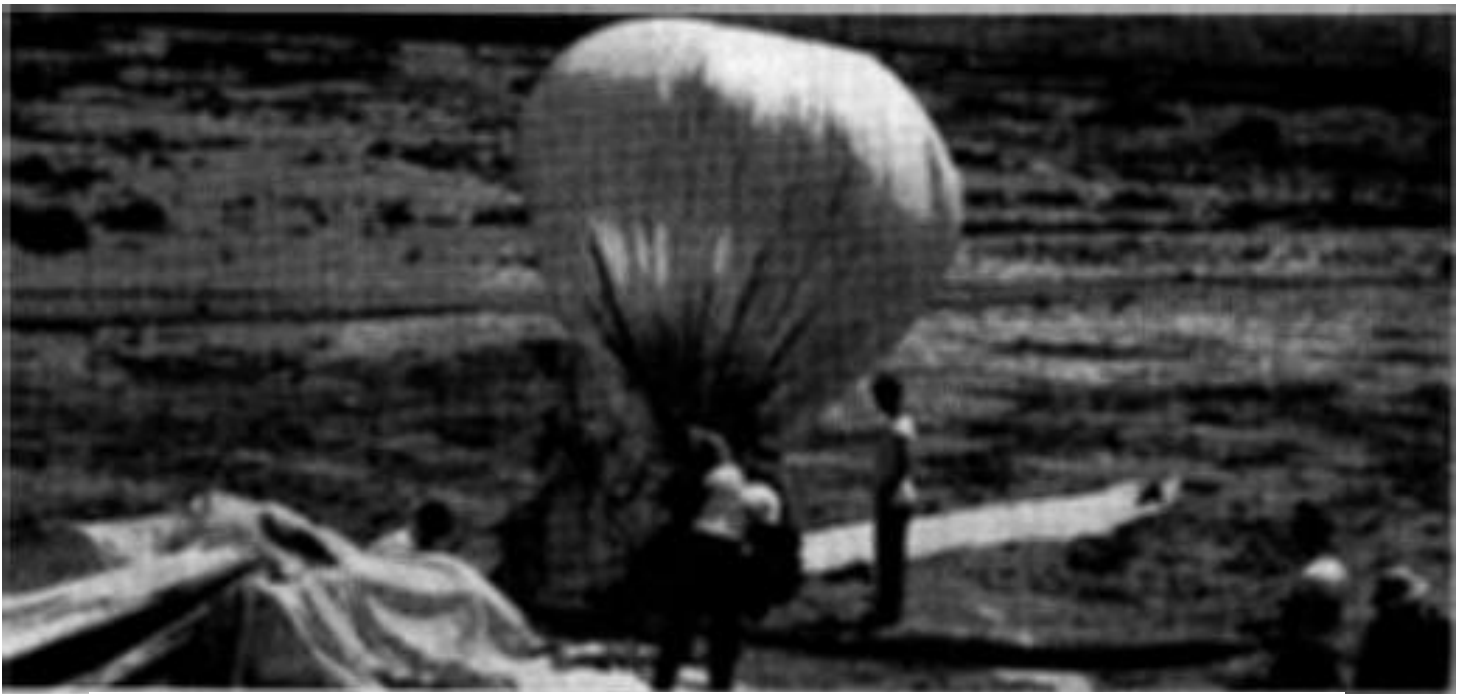
A US Air Force photo of Holloman Balloon Branch personnel preparing a polyethylene balloon laminated with aluminum at the White Sands Proving Ground, New Mexico (McAndrew, 1997).

Shards of metalized polyethylene covered the debris field. Other materials reportedly salvaged from the debris field that were typically incorporated into the 1947 experimental balloon trains included, but were not limited to: pieces of rubber, parts of reflective panels made of balsawood and reflective paper, purplish-pink reinforcement tape imprinted with symbols, and heavy-gauge nylon rope.