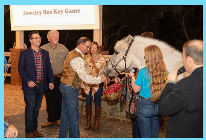
Save the Date: 6<sup>th</sup> Annual Boot Scootin Barn Dance Benefit November 18<sup>th</sup>, 2022