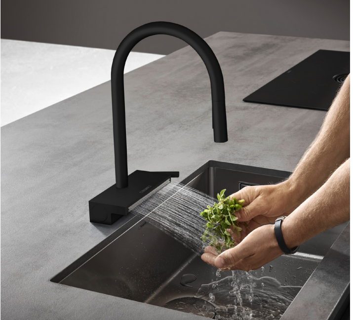
Left: Get a hose pull of up to 30 in. with sBox, as shown here in the Talis N HighArc Kitchen Faucet O-Style (Matte Black finish). Right: Use the Select button on the all-new Aquno Select HighArc Kitchen Faucet (Matte Black finish) to activate SatinFlow, the latest spray innovation from hansgrohe.