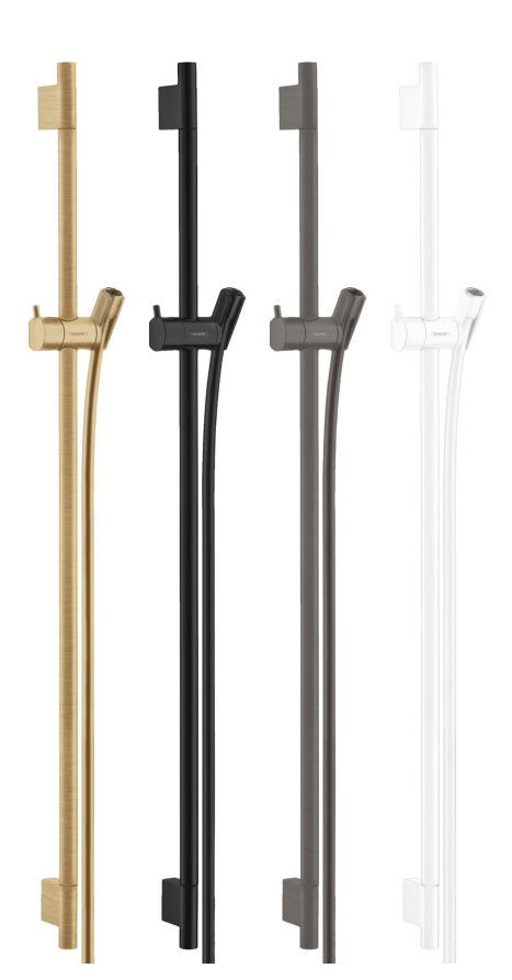
Unica® Wallbar S, 36"

#28631XXX Brushed Bronze (-140), Matte Black (-670), Brushed Black Chrome (-340), Matte White (-700)