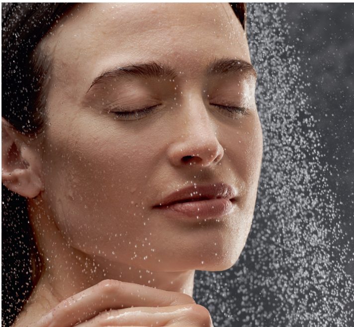
Left: Rainfinity Handshower 130 (Matte White finish) with Select technology, releasing the PowderRain spray mode. Right: PowderRain delivers thousands of small droplets that gently wrap the body like a soft blanket, indulging senses of comfort and rejuvenation.