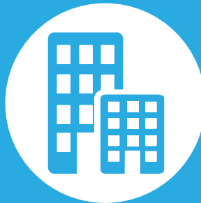
LARGE OFFICE BUILDINGS