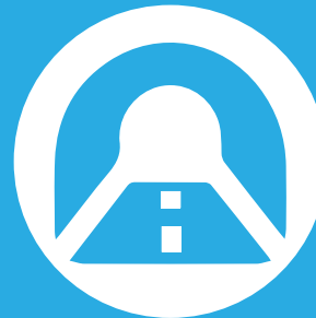
TRANSPORT & TUNNEL NETWORKS