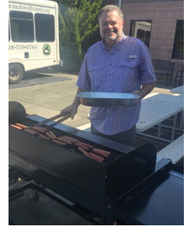
Labor Day Cookout