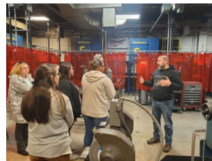
Pre-ETS Class Trip