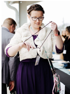
Our Night to Shine!