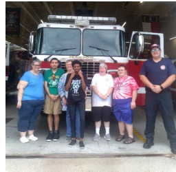
Visiting local heroes