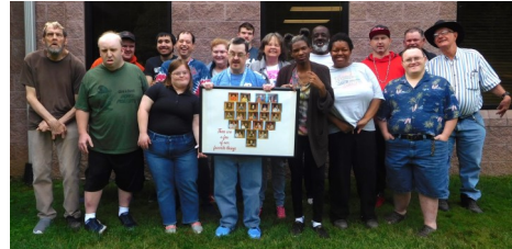
A Few of Our Favorite Things