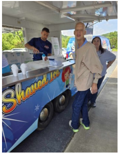
Carolina Snowie fun!