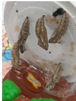
Watching Our Butterflies Grow