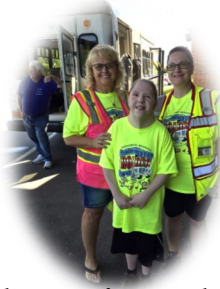
McDowell Transit Rodeo Day