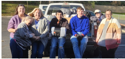
Disaster relief volunteering