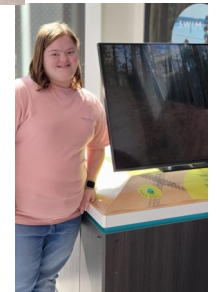
Picnic at Paddy's Creek