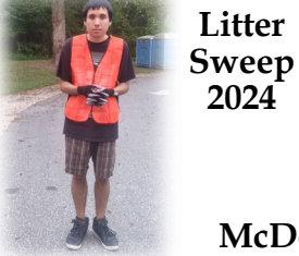
Litter Sweep 2024