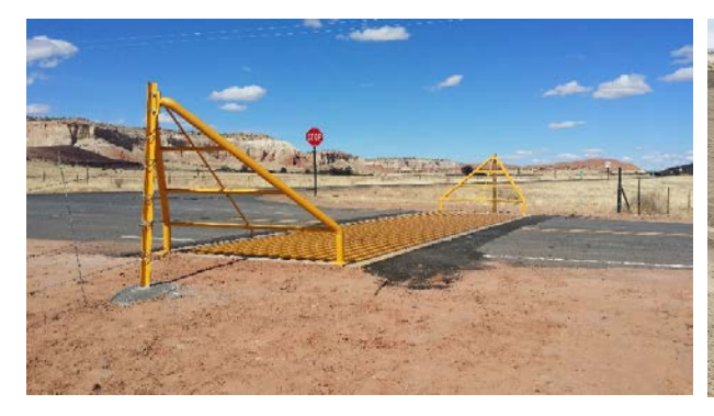
N15 Fencing ~ Greasewood-Burnside, AZ