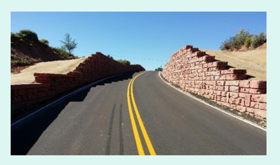
N9345~Wide Ruins, AZ