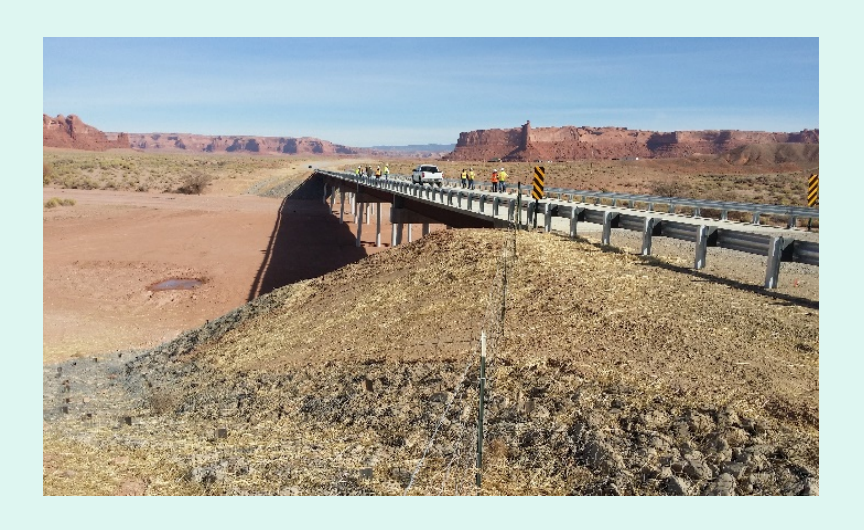
N8008~Round Rock, AZ