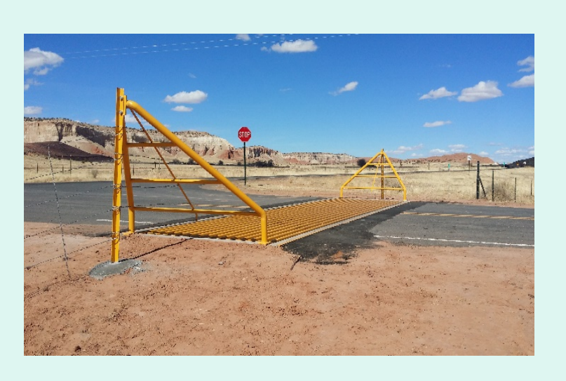
N15 Fencing~Greasewood Springs to Burnside, AZ