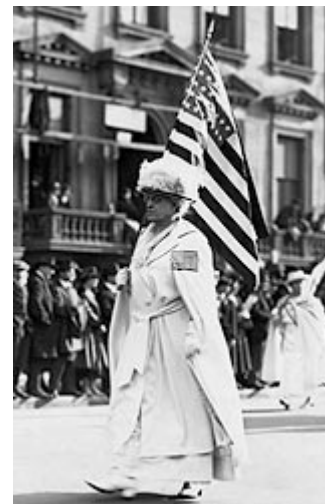
Carrie Chapman Catt