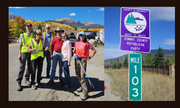
Road Cleanup Crew - October