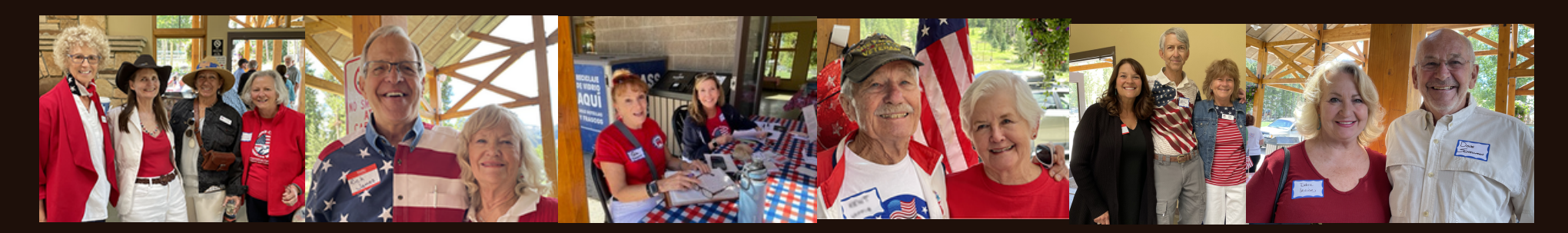
Picnic Carter Park - October