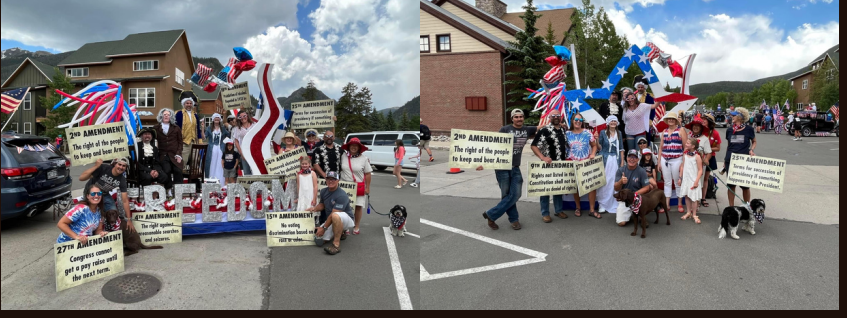
Independence Day Parade - July