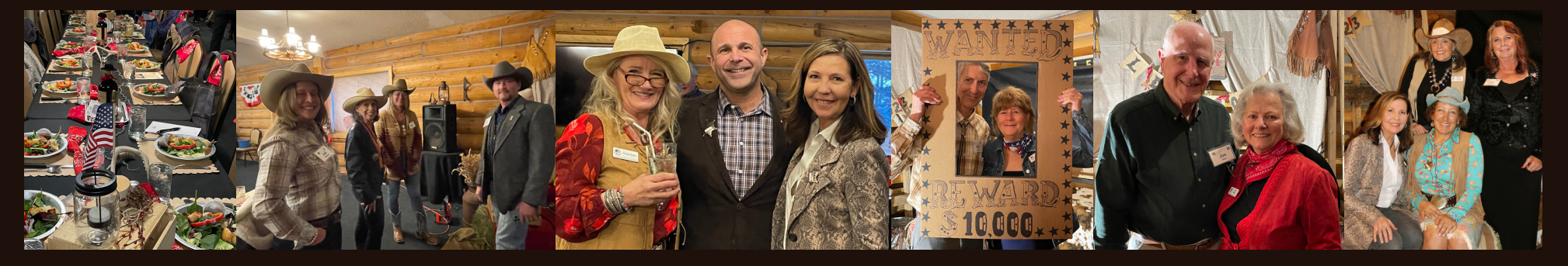
Lincoln Day Dinner - February