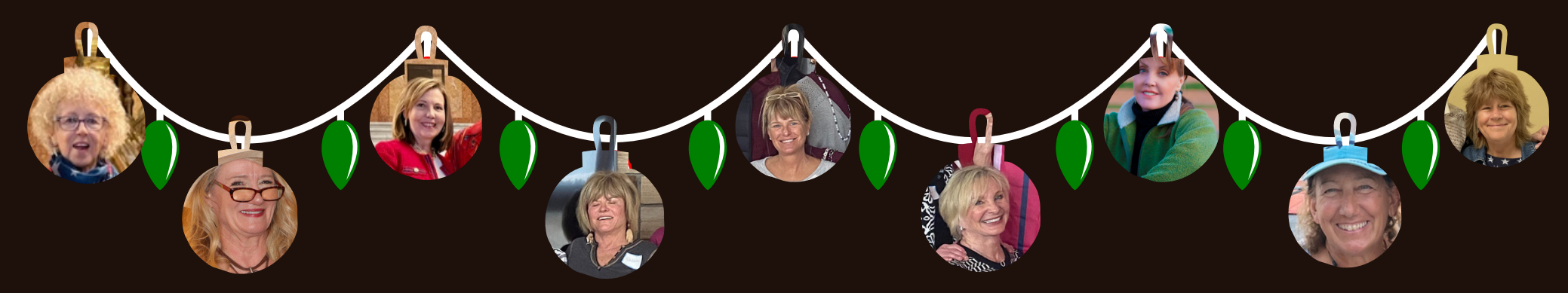
A few of our 2022 Christmas Party Attendees