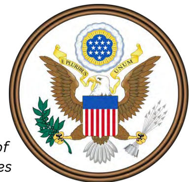
The Great Seal of the United States