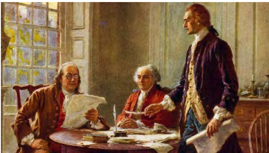
Benjamin Franklin and John Adams meeting with Thomas Jefferson, standing, to study a draft of the Declaration of Independence.