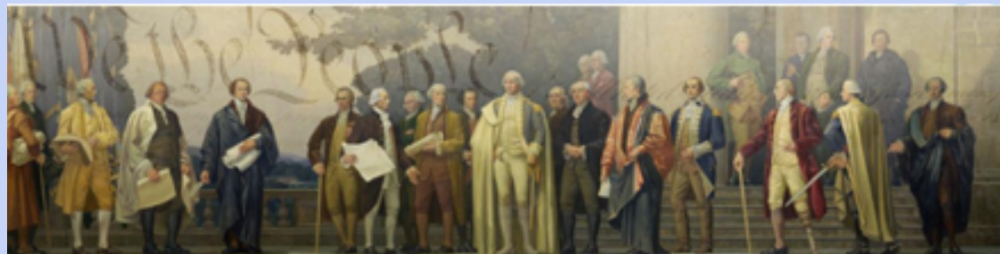
George Washington is about to receive the draft of the Constitution from James Madison in this mural by Barry Faulkner in the National Archives Building

It is said that, after the signing of the Constitution, a woman outside of Independence Hall asked Benjamin Franklin, "What kind of government have you given us?" He replied, "A republic, madam, if you can keep it!" It is up to us to honor our Constitution. We must defend and protect it. It is our obligation to keep our constitutional republic strong and to preserve our God-given rights for ourselves and our posterity.