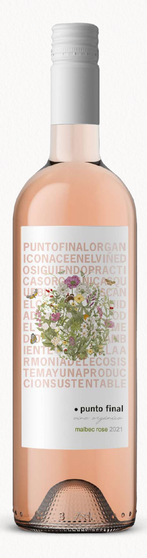
Punto Final Malbec Rosé Organic