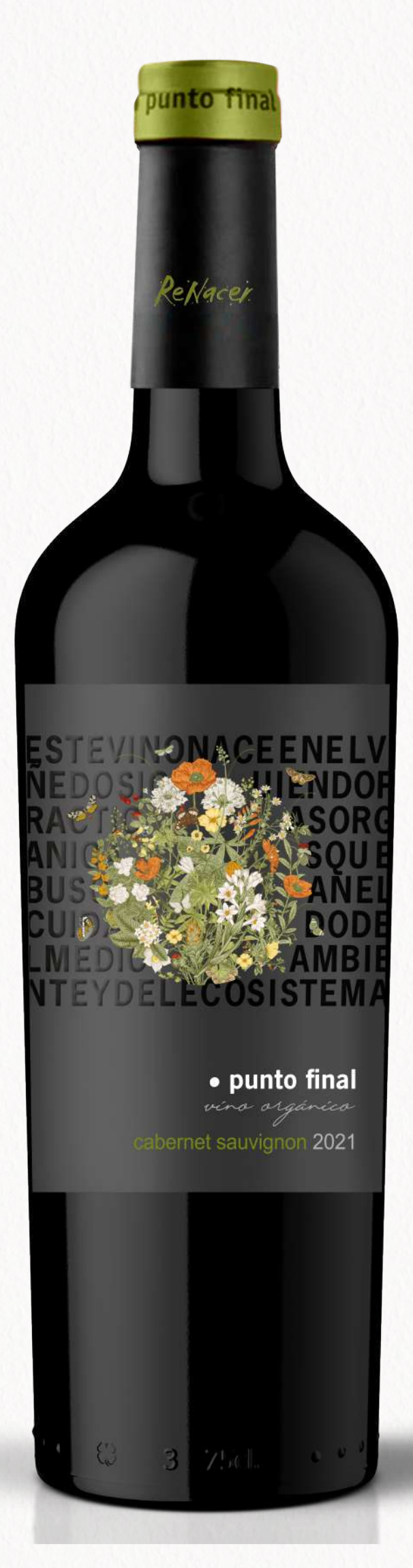
Punto Final Cabernet Sauvignon Organic