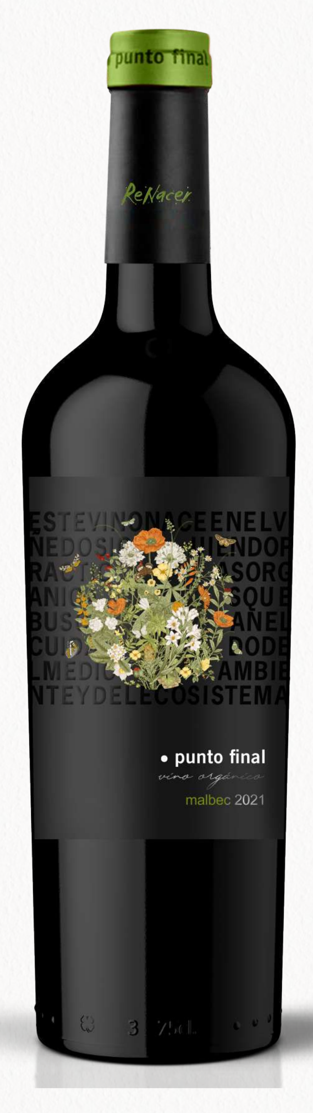
Punto Final Malbec Organic