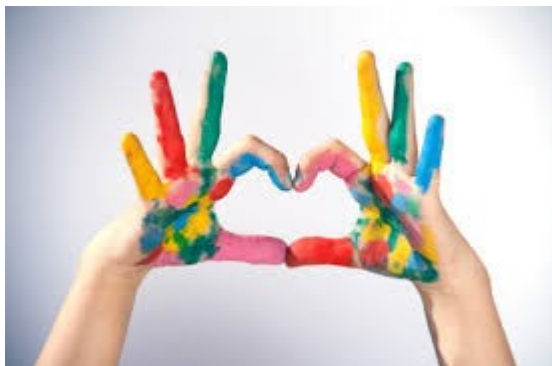
The Art of Relationships Series

Sponsored by Swarthmore Senior Citizens Association ♥ Nether-Swarthmore TimeBank ♥ MOMs Club of Wallingford-Swarthmore ♥ War3house3 ♥ the Swarthmorean ♥ Swarthmore United Methodist Church ♥ Community Arts Center ♥ Swarthmore Town Center, Inc. ♥ Swarthmore Public Library ♥ Swarthmore Community Center ♥ Swarthmore Presbyterian Church ♥ Appalachia Service Project Swarthmore ♥ Swarthmore College Department of Music and Dance ♥