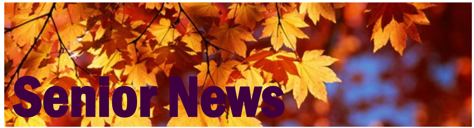
Swarthmore Senior Citizens Association, Post Office Box 306, Swarthmore, PA 19081