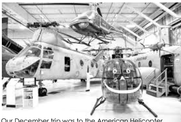
Our December trip was to the American Helicopter Museum in West Chester, with lunch provided by a local Italian restaurant.