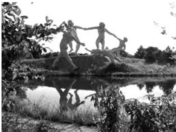
In November we visited Grounds for Sculpture in Hamilton, NJ, with lunch in their cafe.