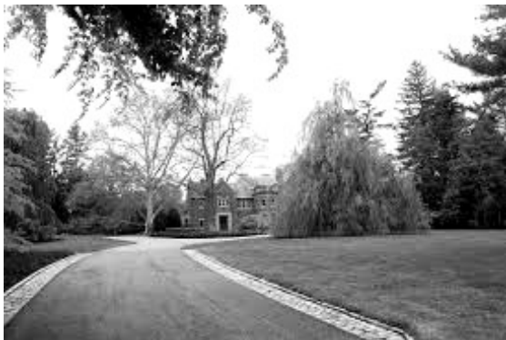
Stoneleigh in Villanova, visited in October. Lunch was at Azie.

We have been doing our own version of the Grand Tour this past Fall, with trips to various locations in the Delaware Valley. Thanks to the generosity of the Swarthmore Presbyterian Church in the use of their bus, and providing volunteer drivers! Here are a few of our destinations: