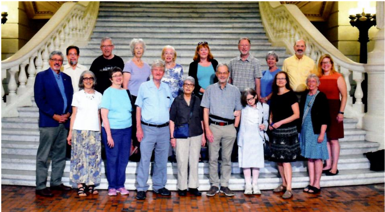
Swarthmore Seniors The Pennsylvania State Capitol August 21, 2019