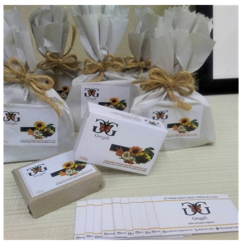
Gift-packaged Gregali Soap

In addition to being a living example of how a solar oven can improve a woman's ability to make a living in a tough economic environment, she's also helping spread another benefit of solar ovens. "I've given demonstrations," she told Erasme, "including to the ex-minister of environmental affairs, Domingues Brito, showing how this oven can save many people by not polluting the environment. No smoke, no firewood." Good news all around!