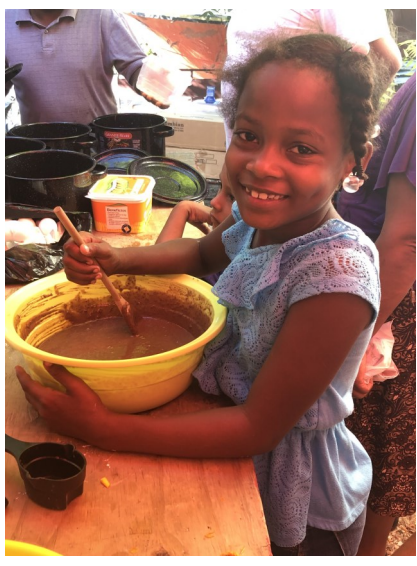
A girl from La Merced is excited to help bake

"It's not that these people didn't need the ovens, but we didn't believe that they would use it," he says. "They showed no interest and did not arrive for the presentation." In other words, they didn't