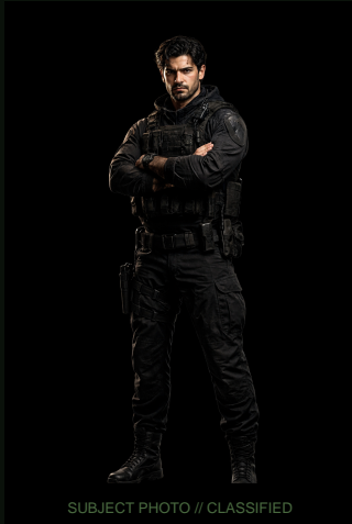
SUBJECT PHOTO // CLASSIFIED

DESIGNATION: SENIOR COMMAND OFFICER, SOUTHERN TRENCH