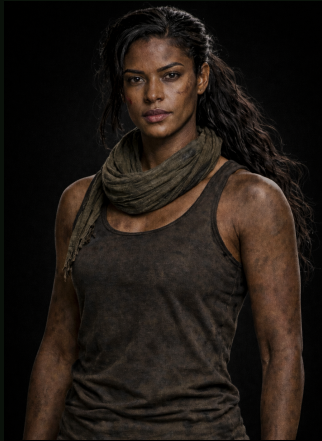
SUBJECT PHOTO // CLASSIFIED