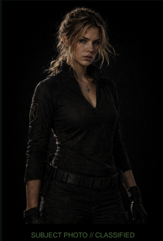
SUBJECT PHOTO // CLASSIFIED