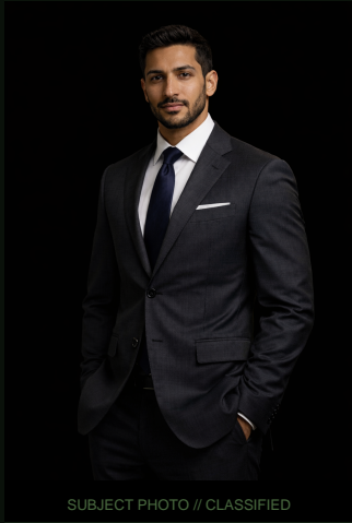
SUBJECT PHOTO // CLASSIFIED

DESIGNATION: CITADEL ADMINISTRATIVE AIDE