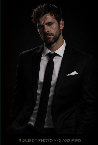
SUBJECT PHOTO // CLASSIFIED