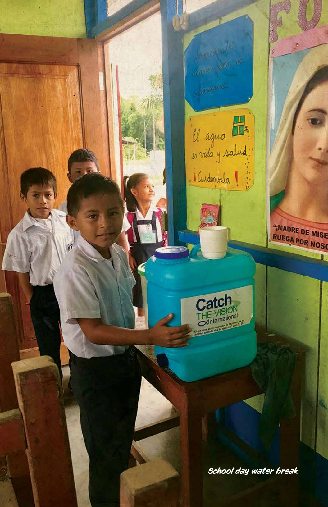
School day water break