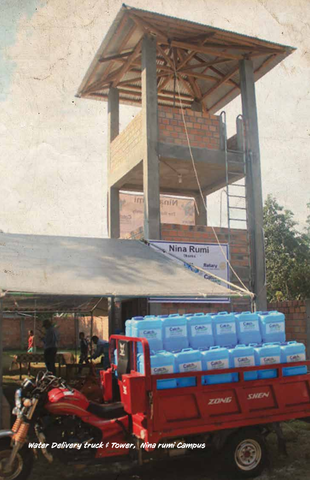
Water Delivery truck & Tower, Nina rumi Campus