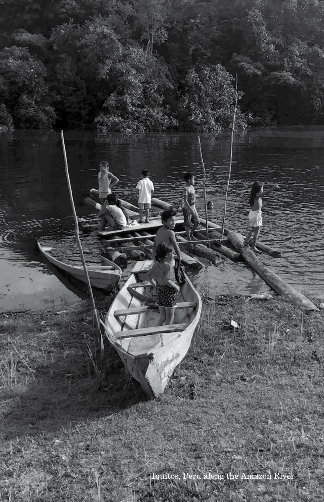
Iquitos, Peru along the Amazon River