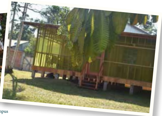
Nina Rumi Campus