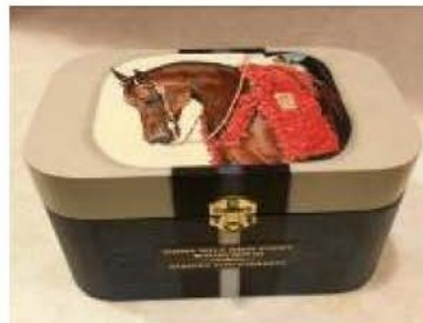
Oil painting of horse on Purse Box