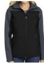
Port Authority Hooded Soft Shell Jacket (black/grey)