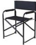
Directors Chair (black) (Addl Cost of $5)