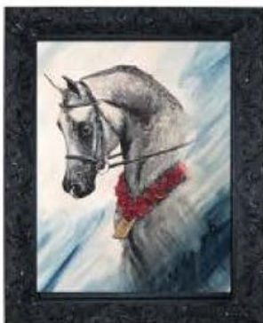
"Custom graphite/charcoal of horse" by Kim Thornborrow 16x20 painting