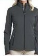
Port Authority Pique Fleece Jacket (Grey)