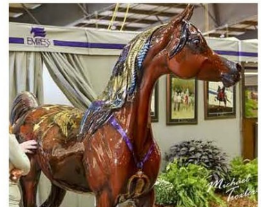
Picture of Salute at US Nationals.

Salute was a featured site at convention and Region X was given the opportunity to speak about Salute's journey. In making Salute's project successful 1) Have passion 2) Create a team 3) Create a brand 4) Set a goal 5) Have activities.