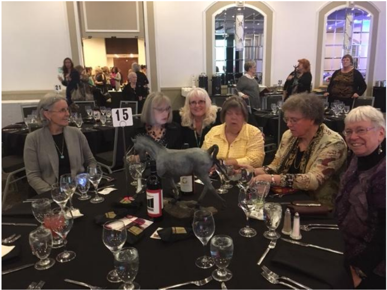
Region 10 Representatives at the AHA Convention: