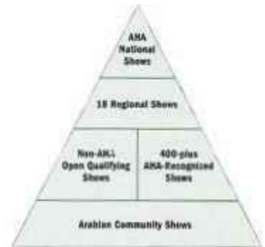
AHA Showing Pyramid Chart

As we observe the beautiful pictures from Youth Nationals, Mid Summer, and multiple regionals, we are in awe of the beautiful horses and horse/rider accomplishments. But, not all Arabian horses are national/regional caliber and while some regional horse numbers are growing, many other regional and local show horse numbers are dramatically down and the clubs that sponsor them are struggling for these local show opportunities to survive. Not all Arabian horse owners/exhibitors can afford or have the horse to show at regional and national levels and showing at local shows may be their pinnacle of success and what is wrong with that! Local shows are AHA's foundation for new horses, young horses, new exhibitors/owners/trainers and current members who do not have the horse or financially can not afford the horse or the expenses to show at the regional/national levels. AHA has said itself “Determining qualifications have never been as simple as often thought. In recent