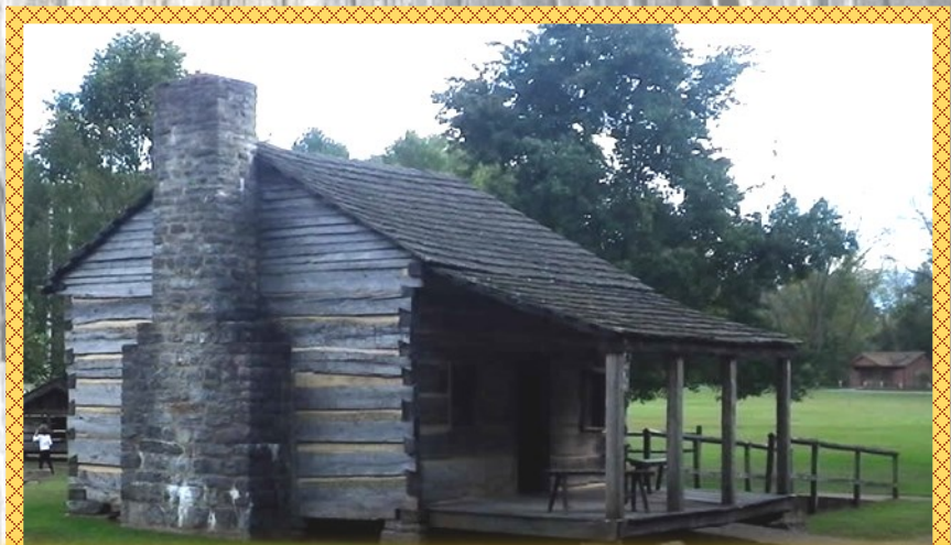
David Crockett Birthplace State Historic Park

1245 Davy Crockett Park Road Limestone, Tennessee 37681