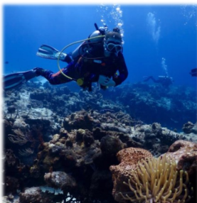
Photo from Cozumel dive trip in March 2018

Join us for a fun filled week of diving in Cozumel, Mexico! We will be spending 7 nights at Scuba Club Cozumel for an all-inclusive stay with 5 days of boat diving, unlimited shore diving, 3 meals a day, and airfare included. Cost per diver is $2,030 for double occupancy room.