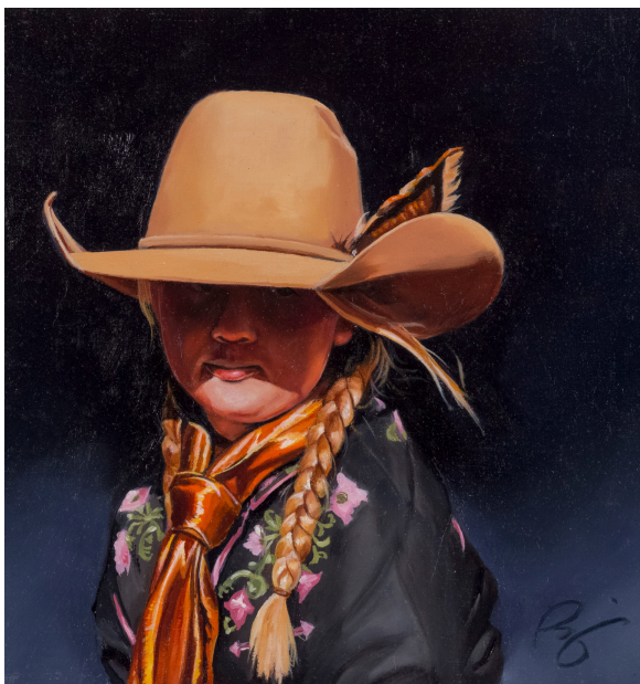
Paige Weber Oil