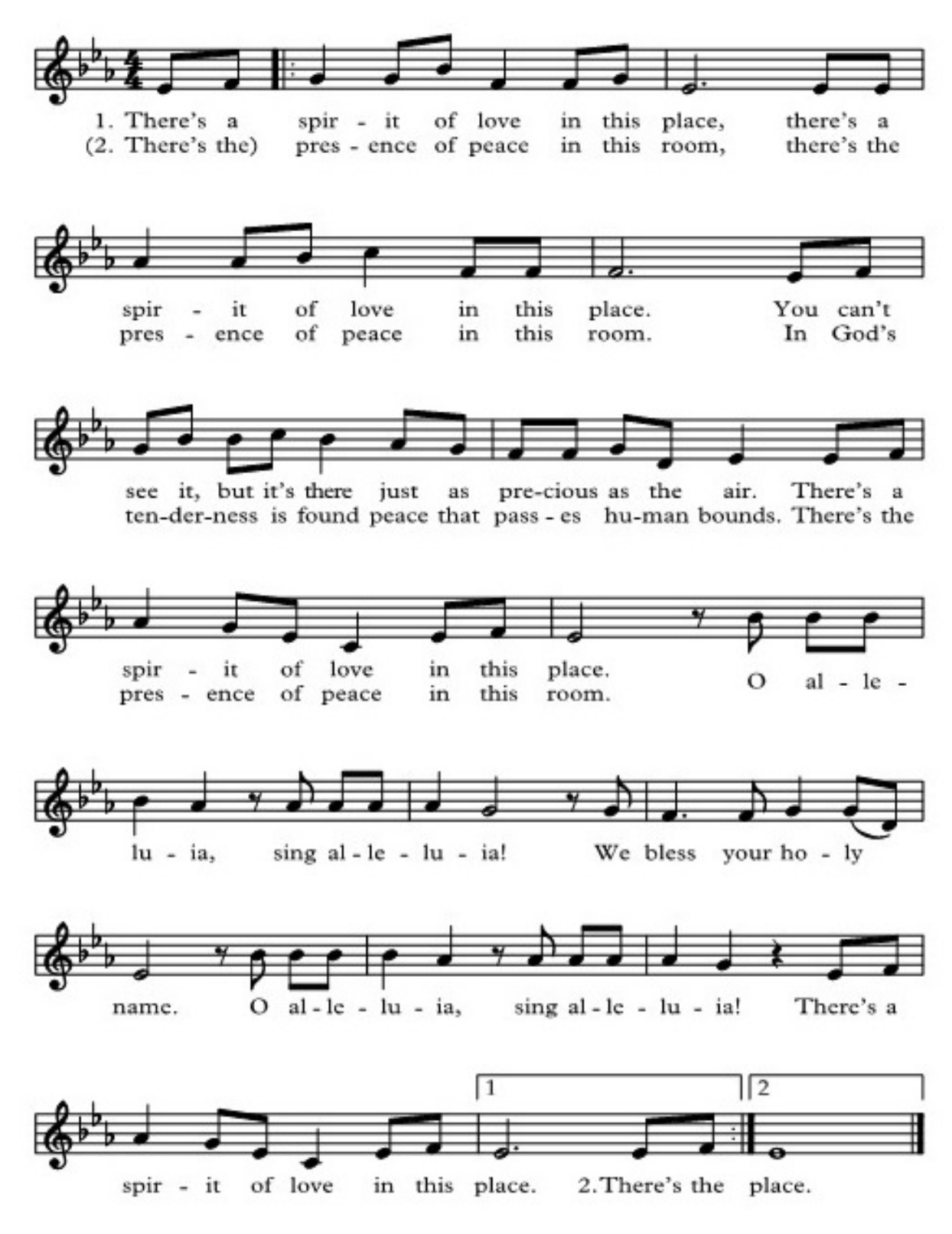
*Please stand as you are able