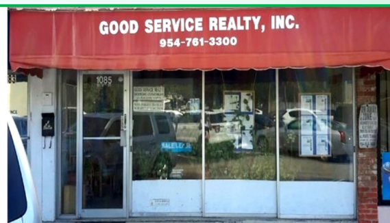
My late mothers retro-window.