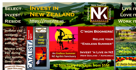
My repurposed, Invest-in-NZ Showcase.