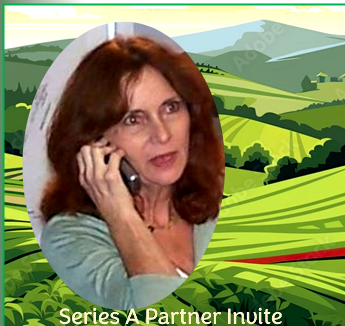
Series A Partner Invite

The New Zealand, 'Endless Summer' Sanctuary Investment Series. "Residency-By-Investment", Golden Visa Program. (Under license to Bruce Brown Films LLC, CA)