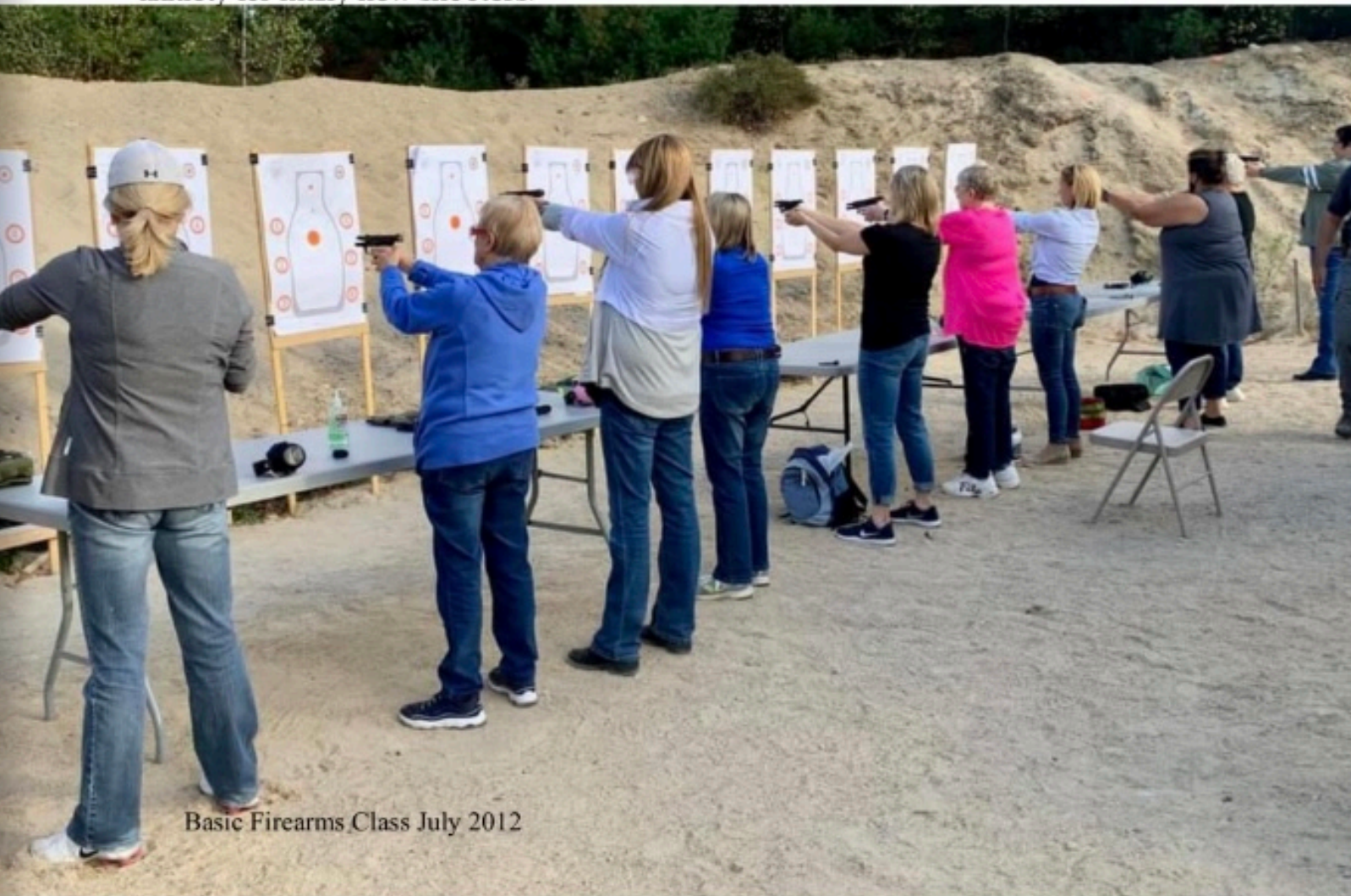
Basic Firearms Class July 2012