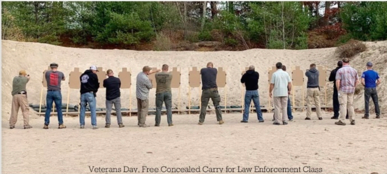
Veterans Day, Free Concealed Carry for Law Enforcement Class