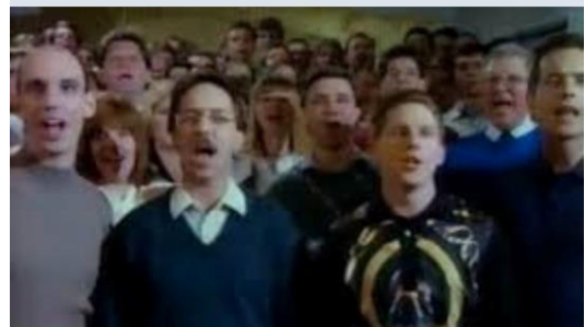
Members of the Church of Scientology in We Stand Tall

“Knowing the truth will set us free And take us from clear to eternity To a future we thought would never be We stand tall”