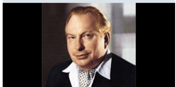
L. Ron Hubbard

"Man is a spiritual being that was pulled down to the material, the fleshly interest to an interplay in life that was in fact too great for him to confront. And I concluded finally, that he needed a hand."