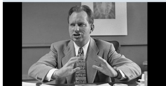
L. Ron Hubbard

“You don't get rich writing science fiction. If you want to get rich, you start a religion.”