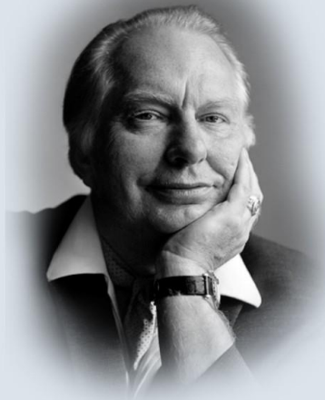
L. Ron Hubbard

“A civilization without insanity, without criminals and without war, where the able can prosper and honest beings can have rights, and where man is free to rise to greater heights, are the aims of Scientology.”