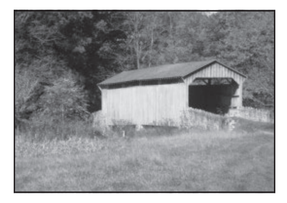
Hayes Clark Bridge, burnt in 1963 and was replaced by Buck & Doe Run Valley Farms