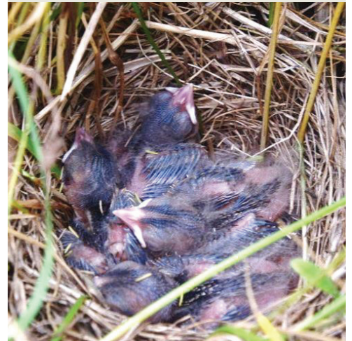
YOUNG GRASSLAND BIRDS NESTING ON THE GROUND.