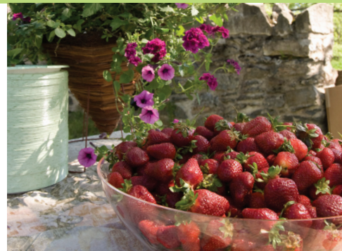
SPRING FLING BREAKFAST