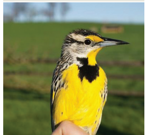
MEADOWLARK: A GRASSLAND, SONGBIRD WITH SHORT TAILS AND LONG, SPEAR-SHAPED BILLS.