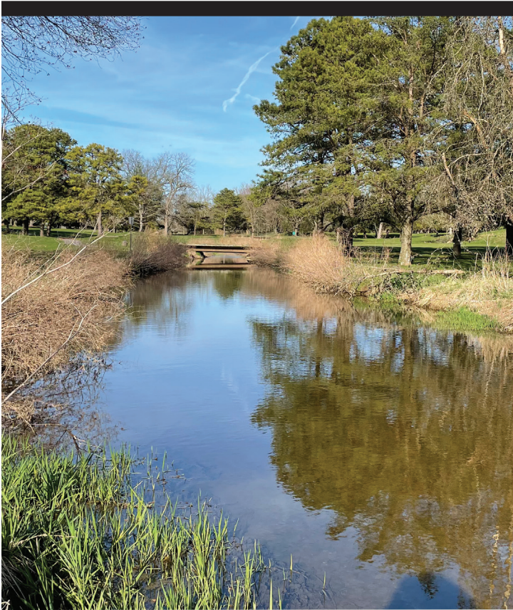
LOCH NAIRN PRESEVED!