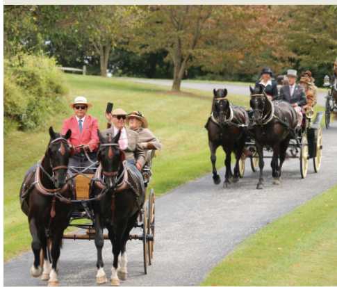
A WELL-APPOINTED CARRIAGE DRIVE