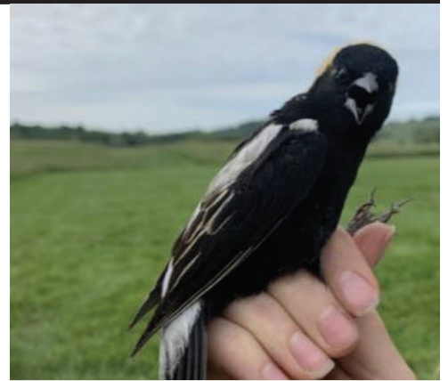
BOBOLINK: A GRASSLAND BIRD (AN OLD NAME FOR THIS SPECIES WAS "RICE BIRD", FROM ITS TENDENCY TO FEED ON CULTIVATED GRAINS DURING WINTER AND MIGRATION.)