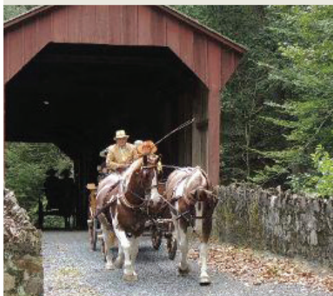
HAYES-CLARK COVERED BRIDGE