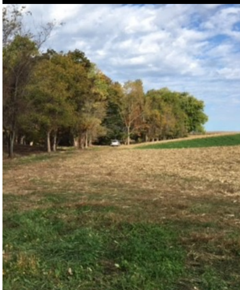
FALL 2017 BEFORE PLANTING