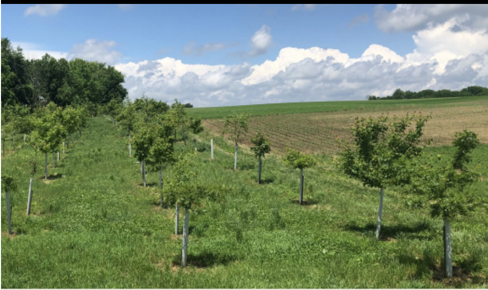
JUNE 2021 FOUR YEARS AFTER PLANTING

milestone. In the spring of 2022, Burley and Lizzie Vannote plan to plant a streamside forest that takes the total acres restored on the Red Clay's west branch to over 100.