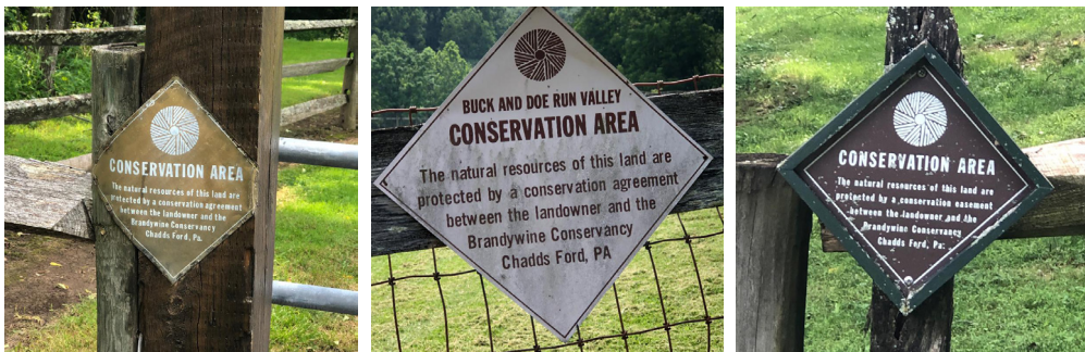
EXAMPLES OF CONSERVATION SIGNS USED THROUGH THE YEARS WHICH ARE STILL DISPLAYED TODAY