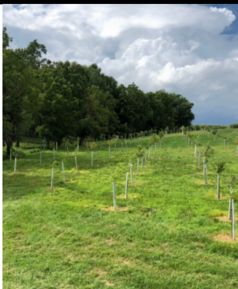
MAY 2018 FIRST GROWING SEASON