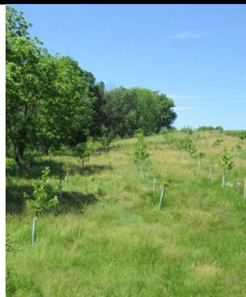
AUGUST 2019 END OF SECOND GROWING SEASON