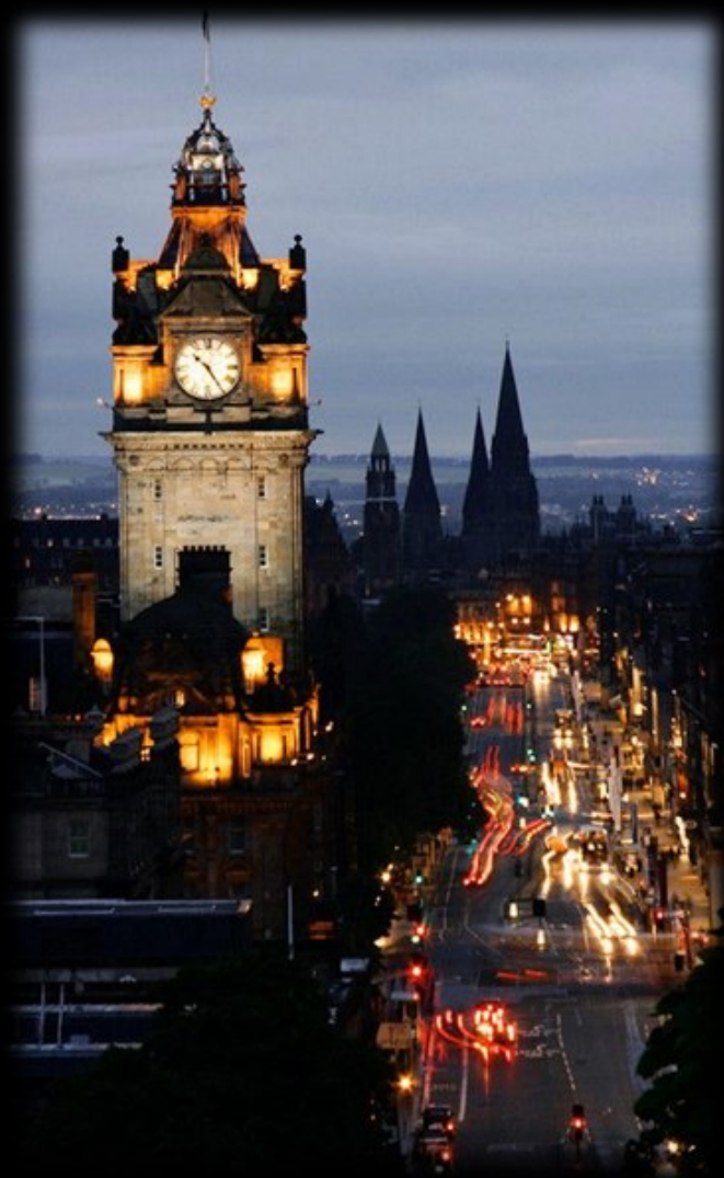
Balmoral Clock - Edinburgh Skyline

To control the castle was to hold the keys to the kingdom.