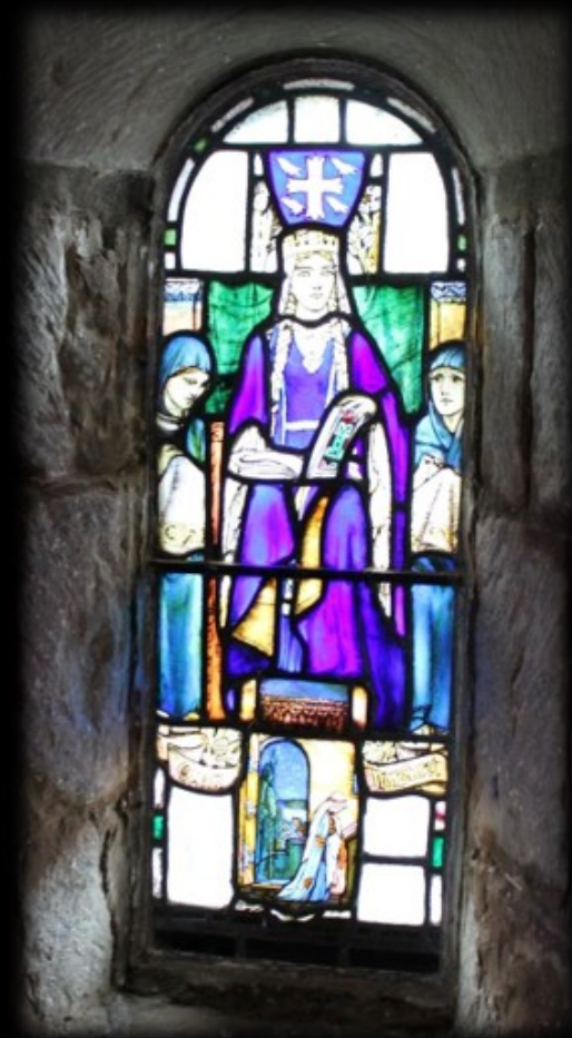
St. Margaret Stained Glass Window

In the 16th century, the chapel was used as a gunpowder store and was later given bomb-proof vaulting.