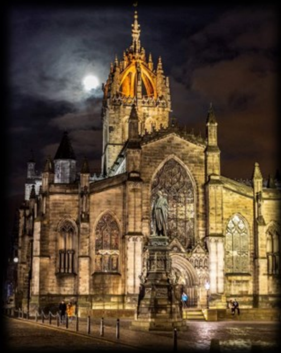
St. Giles Cathedral

St Giles' Cathedral is the official Church of Scotland and the Mother Church of Presbyterianism. It's named after the patron saint of beggars and disabled people.