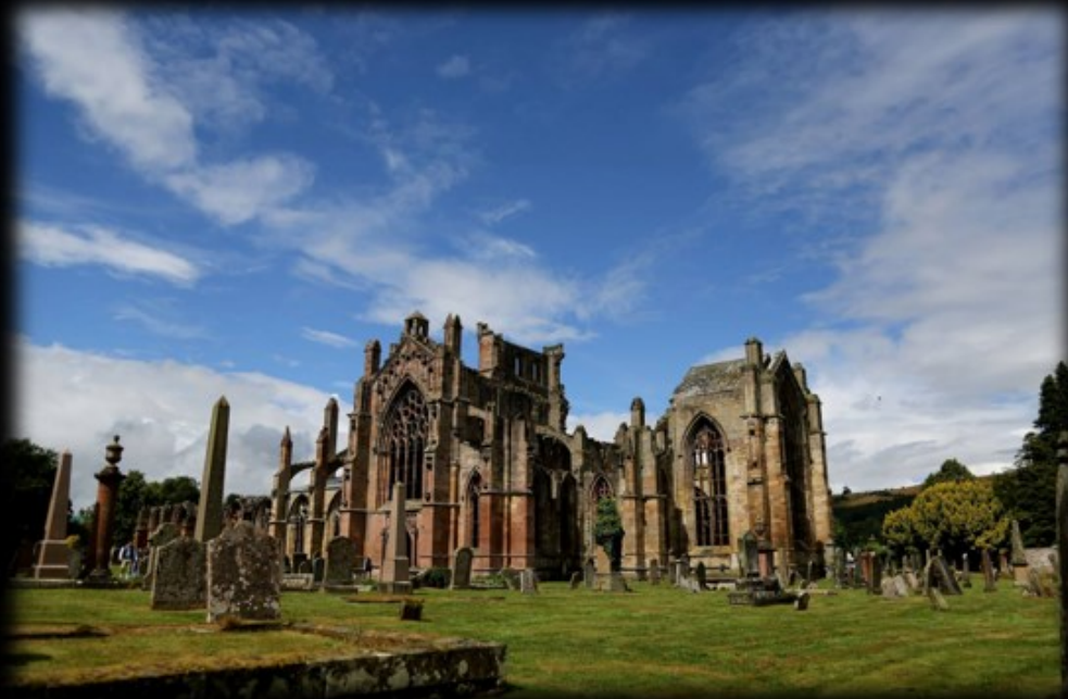
Melrose Chapel Ruins

Melrose Chapel at St Mary's Abbey, Melrose is a partly ruined monastery of the Cistercian order in Melrose, Roxburghshire, in the Scottish Borders. It was founded in 1136 by Cistercian monks at the request of King David I of Scotland , and was the chief house of that order in the country until the Reformation. It was headed by the Abbot or Commendator of Melrose. Today the abbey is maintained by Historic Scotland.