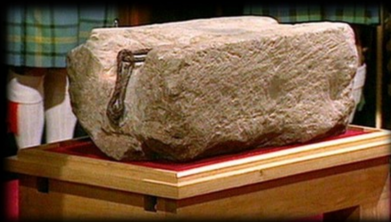
Stone of Destiny

coronation ceremonies for the monarchs of England and then Great Britain.