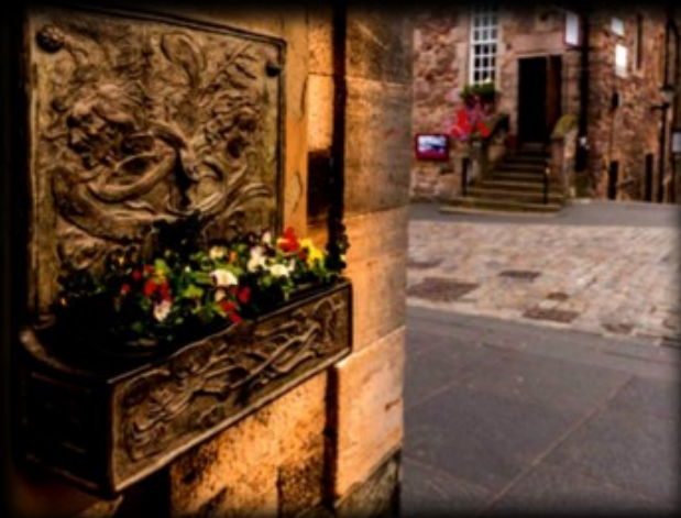
The Witches Well