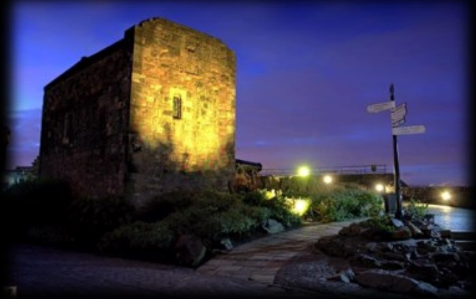
St. Margaret's Chapel

Picture to the left is St. Margaret's Chapel. The chapel is still used for christenings and weddings.