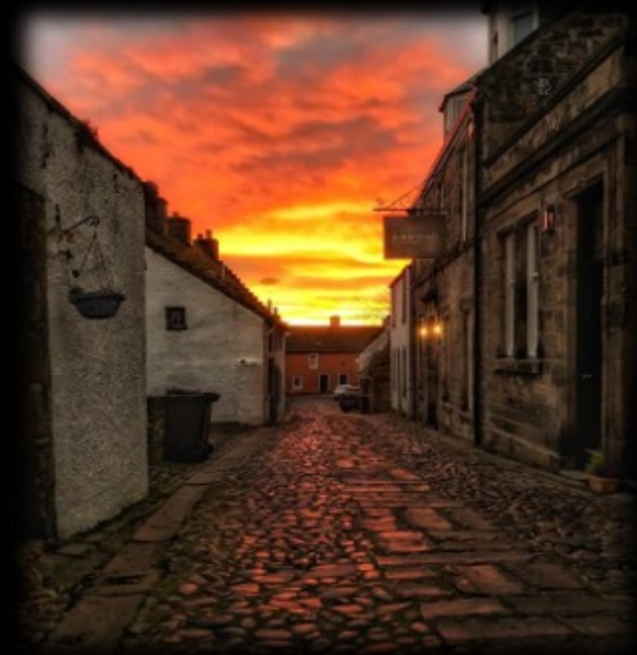
Culross Cobblestone Road

A legend states that when the British princess (and future saint) Teneu, daughter of the king of Lothian, became pregnant before marriage, her family threw her from a cliff. She survived the fall unharmed, and was soon met by