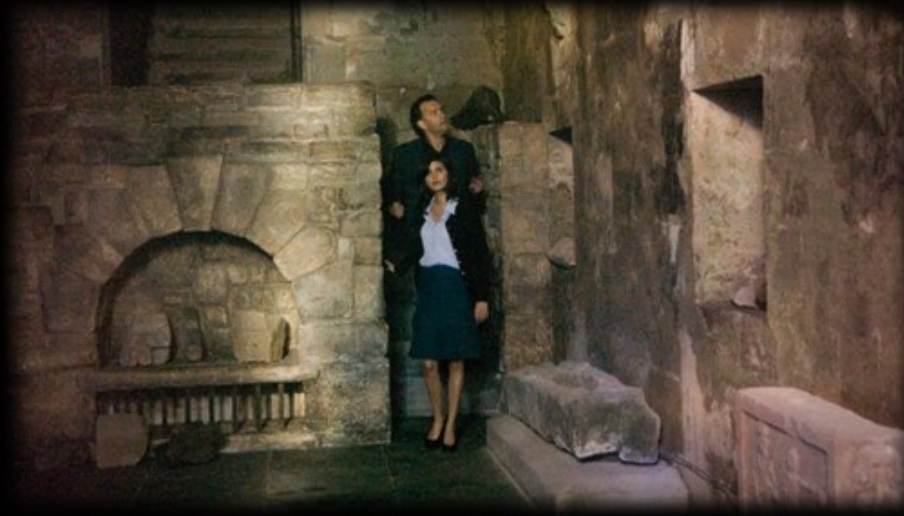
DaVinci Code scene in Rosslyn Chapel

Melrose Chapel at St Mary's Abbey, Melrose is a partly ruined monastery of the Cistercian order in Melrose, Roxburghshire, in the Scottish Borders. It was founded in 1136 by Cistercian monks at the request of King David I of Scotland , and was the chief house of that order in the country until the Reformation. It was headed by the Abbot or Commendator of Melrose. Today the abbey is maintained by Historic Scotland.