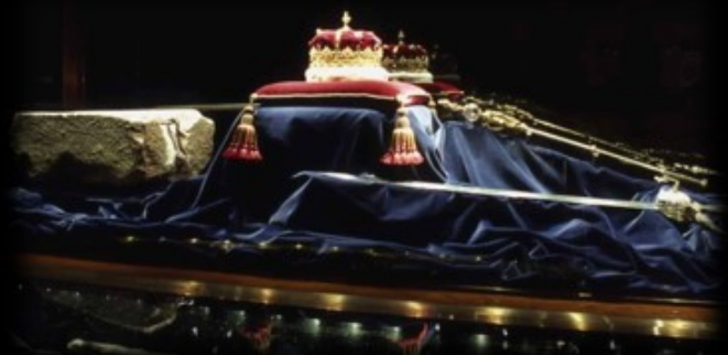
Crown Jewels of Scotland

Known as The Honors of Scotland they are displayed in