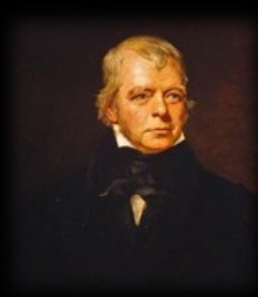
Sir Walter Scott

In 1818, they were rediscovered by the novelist Sir Walter Scott, and with them a mysterious silver wand.