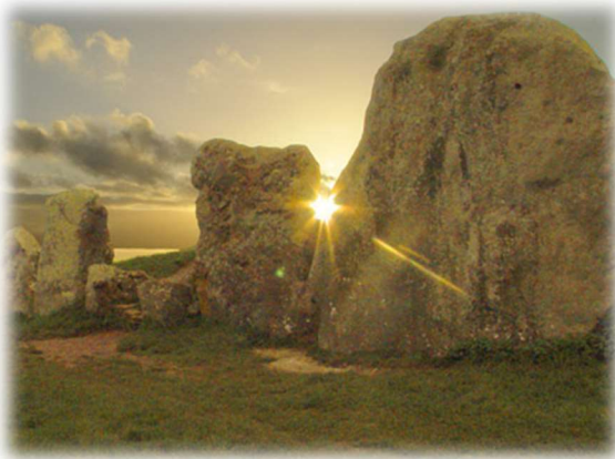
West Kennet Long Barrows

West Kennet Long Barrow: This mound one of many prehistoric monuments that are part of the Avebury complex of Neolithic sites. It is one of the most impressive and well preserved burial chambers in Britain. It lines up with the rising sun on the summer solstice.