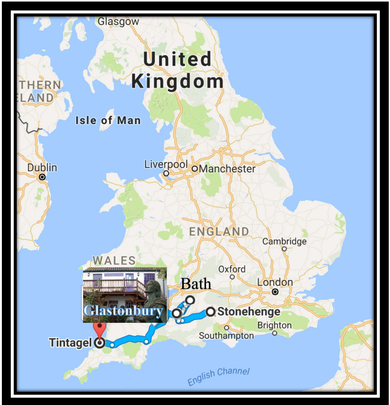
Our Journey Map of England