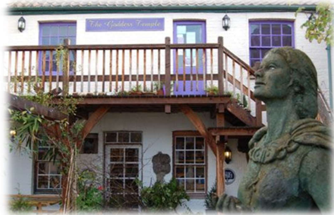
Glastonbury Goddess Temple

A Priestess of Avalon will provide and talk about the temple, Goddesses and a meditation where we will meet the Lady of Avalon. This is private for our Goddess Group.