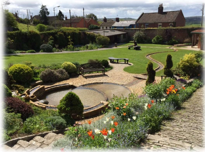
Chalice Well Peace Gardens