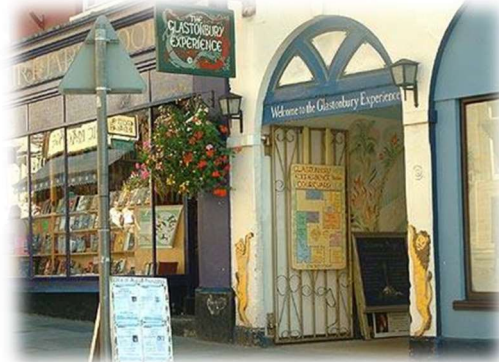
Glastonbury Magdalene and High Street

Many optional activities you can include on your free day are: visit The Abbey (grave of King Arthur and Guinevere), walk a labyrinth at St. John's