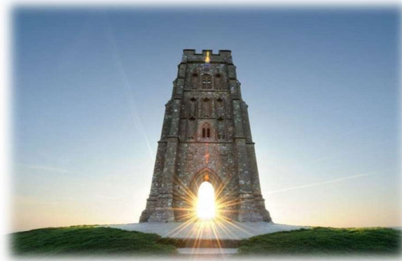
The Tor, St. Michael's Tower

The Tor: Goddesses will meet and walk the Tor. The Tor is a symbol of the Mother and is our first stop. It is a place where the veil is thin between the worlds. It was an Islet for centuries, as the floodwaters took a long time to recede. In ancient times, it was called the Island of Glass and connected to the mainland by only a narrow strip of land at low tide.