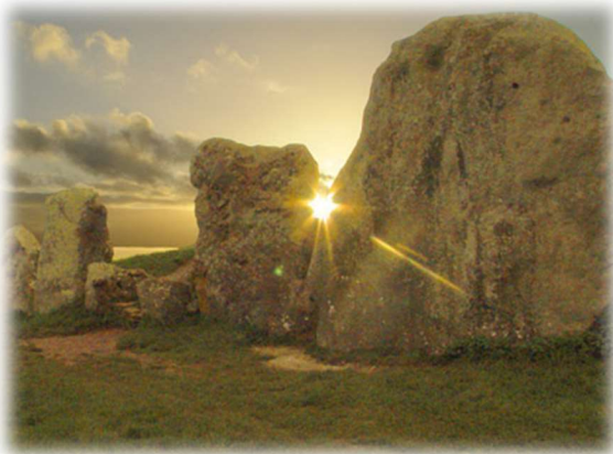
West Kennet Long Barrows

West Kennet Long Barrow: This mound one of many prehistoric monuments that are part of the Avebury complex of Neolithic sites. It is one of the most impressive and well preserved burial chambers in Britain. It lines up with the rising sun on the summer solstice.