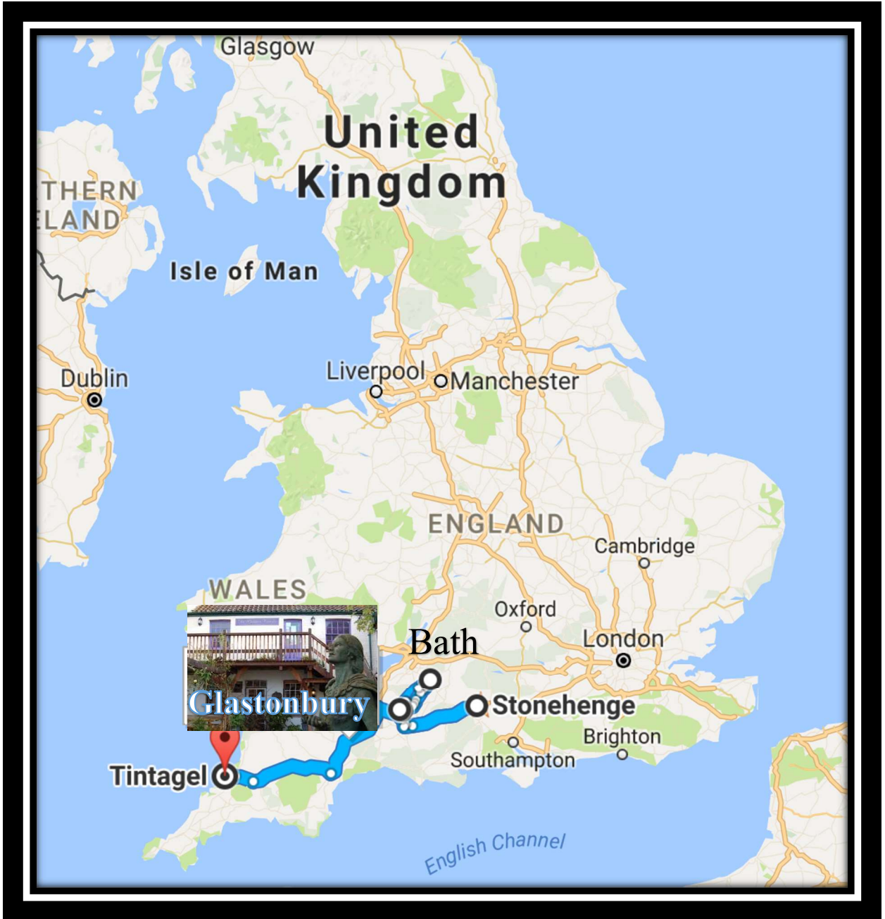
Our Journey Map of England