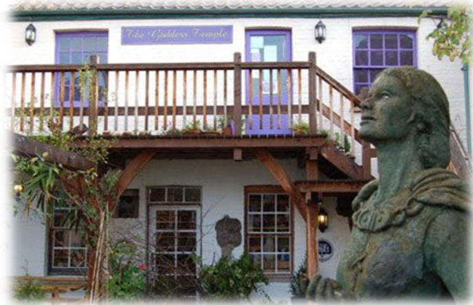
Glastonbury Goddess Temple