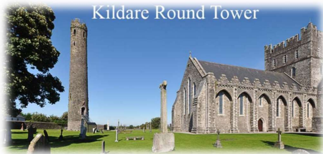
Kildare Round Tower

They had a twofold use: as belfries, and as places of safety to store monastic treasures in case of a sudden attack from an invader. They also may have been used as beacons and watchtowers. The 11 th century or earlier round