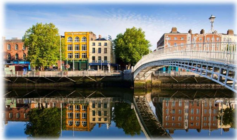
Ha' Penny Bride over the Liffey River