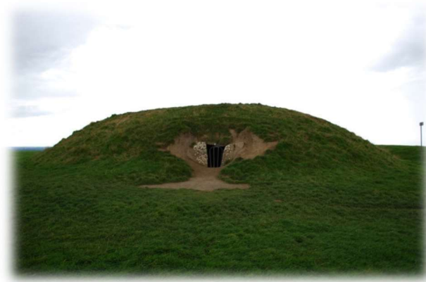
Mound of Hostages

subdivided by sill stones into three compartments, each containing cremated remains.