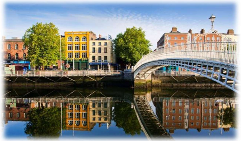
Ha' Penny Bride over the Liffey River