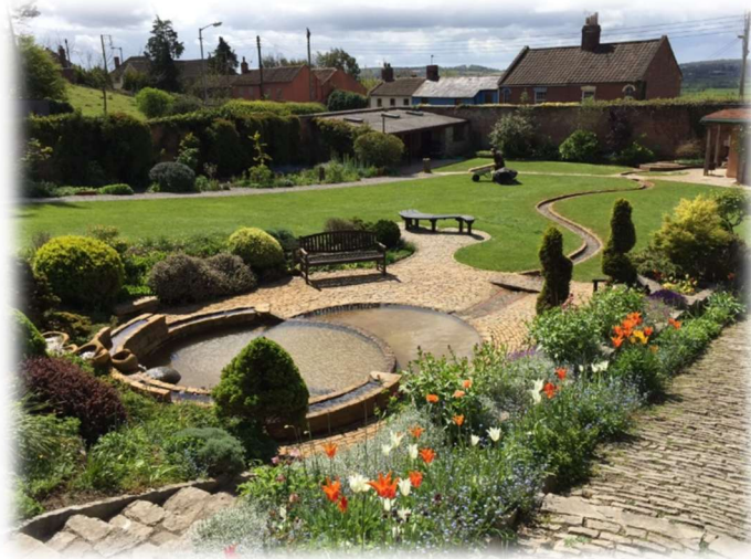
Chalice Well Peace Gardens

You may collect Chalice water to drink or for your spiritual bathing practice.