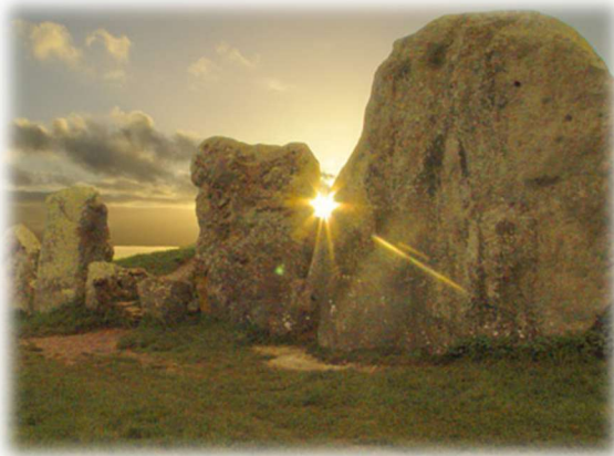
West Kennet Long Barrows

West Kennet Long Barrow: This mound one of many prehistoric monuments that are part of the Avebury complex of Neolithic sites. It is one of the most impressive and well preserved burial chambers in Britain. It lines up with the rising sun on the summer solstice.