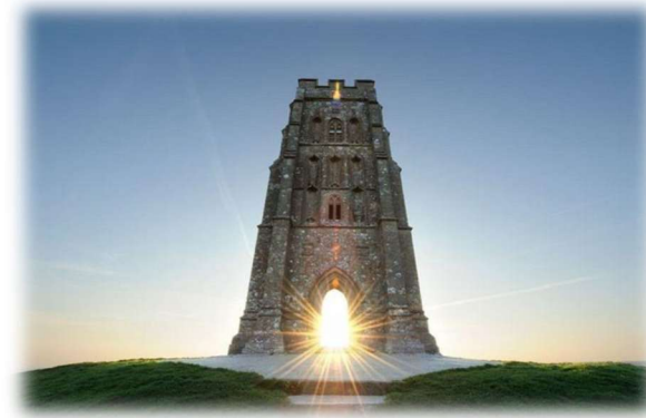
The Tor, St. Michael's Tower

The Tor: Goddesses will meet and walk the Tor. The Tor is a symbol of the Mother and is our first stop. It is a place where the veil is thin between the worlds. It was an Islet for centuries, as the floodwaters took a long time to recede. In ancient times, it was called the Island of Glass and connected to the mainland by only a narrow strip of land at low tide.