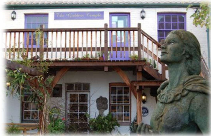
Glastonbury Goddess Temple

A Priestess of Avalon will provide and talk about the temple, Goddesses and a meditation where we will meet the Lady of Avalon. This is private for our Goddess Group.