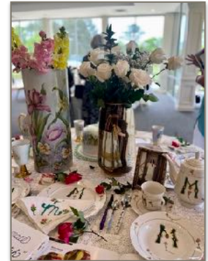
"Hand Painted China" Melina Fiorella