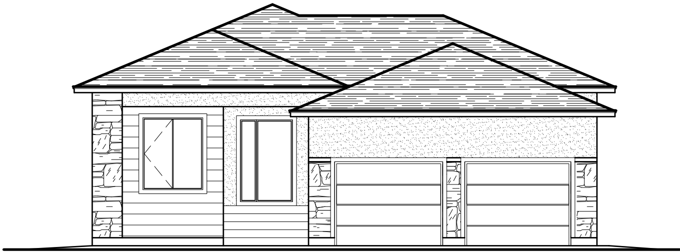
F R O N T E L E V A T I O N