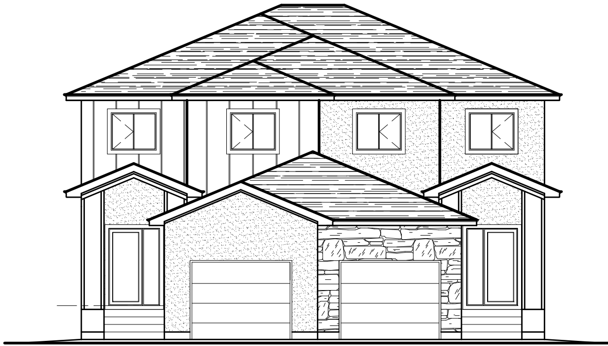
F R O N T E L E V A T I O N