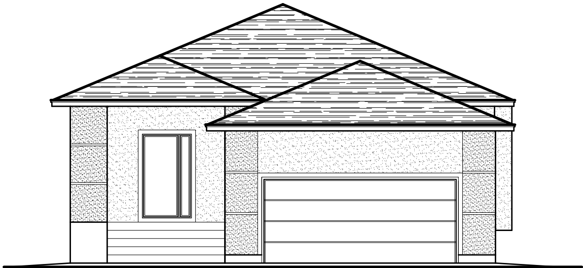
F R O N T E L E V A T I O N