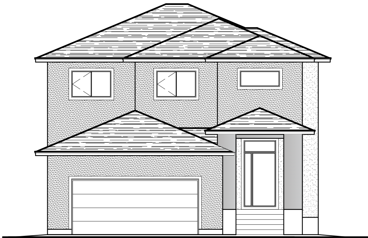
F R O N T E L E V A T I O N